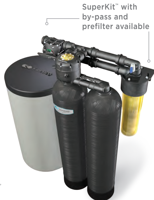
Model Shown: S250

An unlimited supply of clean and healthy drinking water can be yours too.