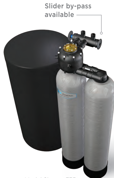
Model Shown: 735

5 Year Warranty: Rest assured, we stand behind our products.